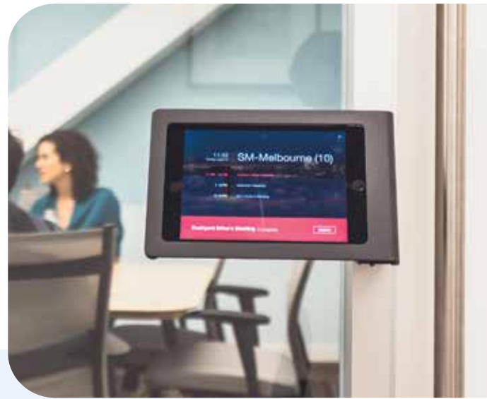
Scheduling Display provides room status and booking capabilities

End scheduling headaches with a beautiful display that provides room availability, check-in for utilization management, and capabilities to book a meeting for any available time of that day.